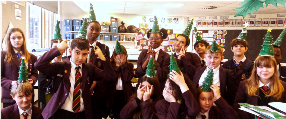
Year 7 elves have been making mini Christmas tree hats!