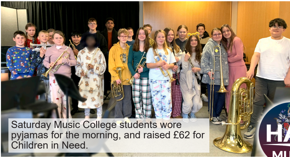
Saturday Music College students wore pyjamas for the morning, and raised £62 for Children in Need.