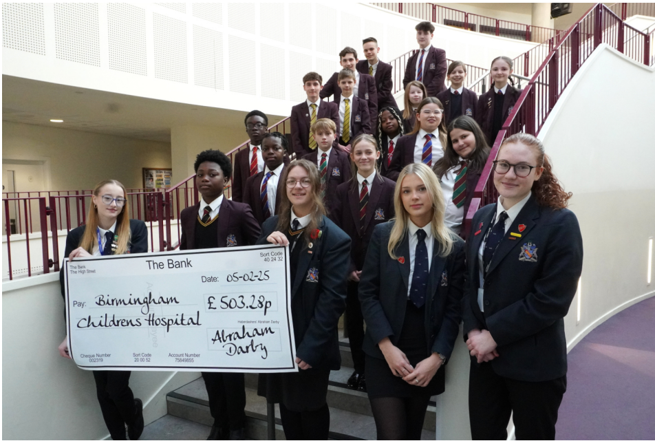
Participants from the first ever Big Gig talent show have raised £500 for their chosen charity Birmingham Childrens Hospital. The money was raised from ticket sales, a raffle and refreshments.