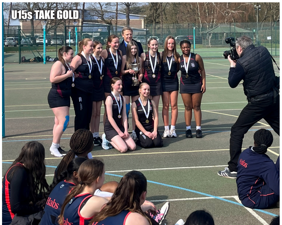
U15s TAKE GOLD

The Year 9 and 10s have recently been crowned TAW trophy winners. The girls are very excited with their success as you can well imagine.