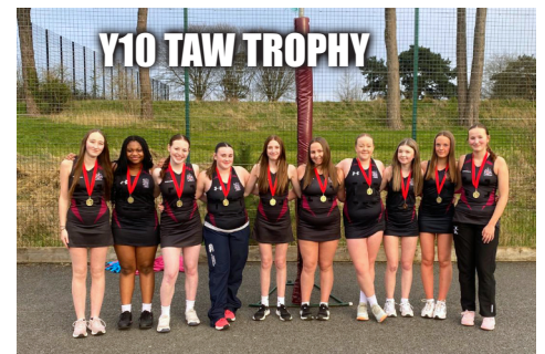
Y10 TAW TROPHY

The Year 9 and 10s have recently been crowned TAW trophy winners. The girls are very excited with their success as you can well imagine.