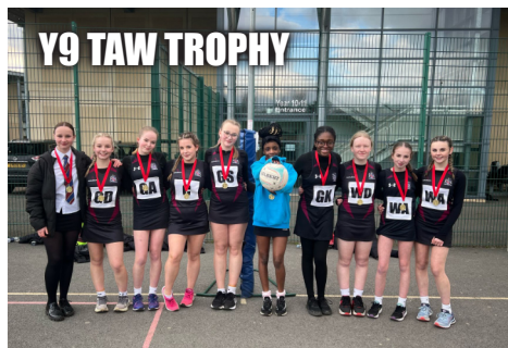
Y9 TAW TROPHY