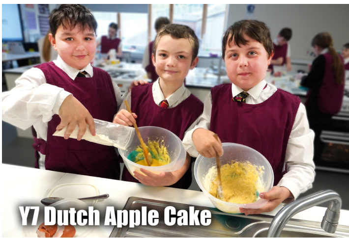
Y7 Dutch Apple Cake